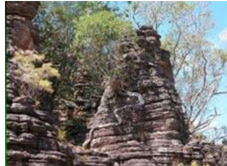
1.65 Ga Kombolgie Formation deposited by a braided river system that was probably syndepositional with the Barney Creek Formation and possibly feeding into the sea of the McArthur Basin. Bardedjilidji in Kakadu National Park, northern Australia.