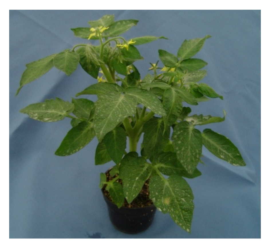
MT-brl showing broad leaves. MT-brl tends to be more robust than MT.