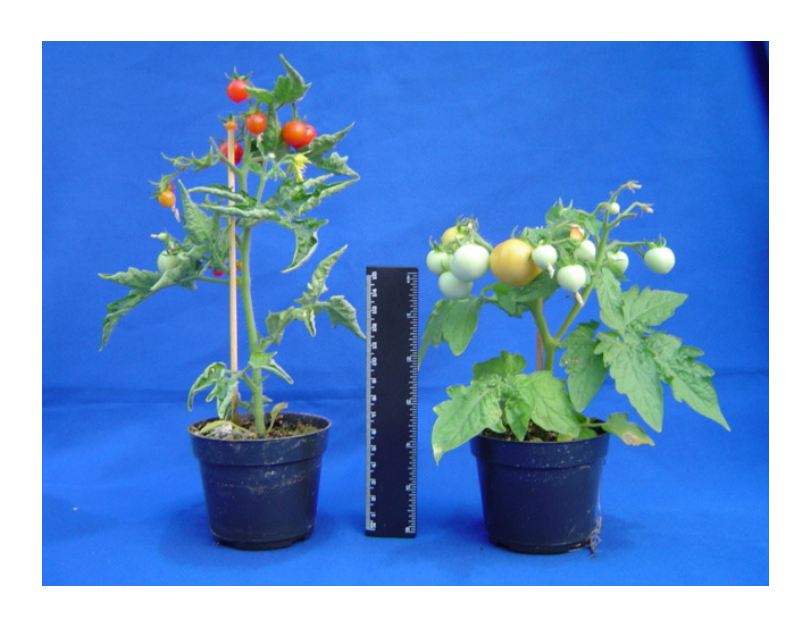
MT-dgt (left) showing hyponastic leaves and a slender shoot