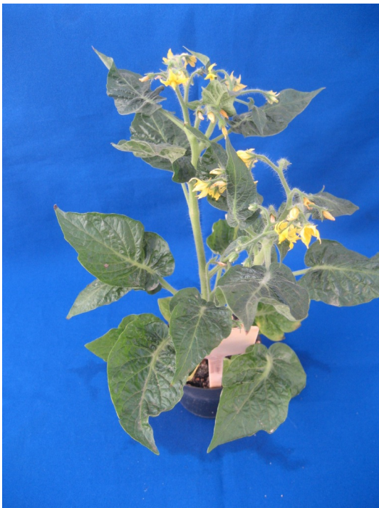
MT-e showing simple leaves